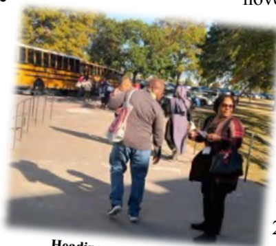
Heading out to Evangelize

A testament to building unity in the Body of Christ was